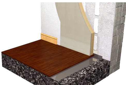
Solid walls: internal dry lining MLK fixed to plaster dabs