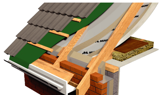
Pitched roof: MLK below rafters